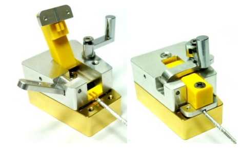
Fig 3: LT-100R-20GC with DUT pressed.

There is a twin groove for raw cable pressed. User just need put the conductors of pair contacted with the groove. Put the Yellow-Kit down and press the conductors for the measurements.